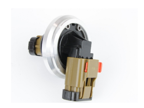
Assembled Bulkhead Connector and Aluminium Ring with circlip and electrical plugs